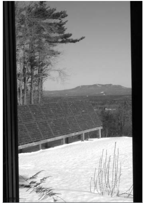
A home in the woods of New Hampshire had too much shade to use PV on the roof. The solution was installing a freestanding PV array.

It might not be. You generally get what you pay for, and it's possible that a low price could be a sign of inexperience. Companies that plan to stay in business must charge enough for their products and services to cover their costs, plus a fair profit margin. Therefore, price should not be the only consideration, and quality should probably rank high on the list.