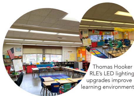
Thomas Hooker ES: RLE's LED lighting upgrades improve learning environment.

Annual Savings $706,028 Incentive Savings $2.4M Energy Savings 2.87M kWh Project Payback 2 years